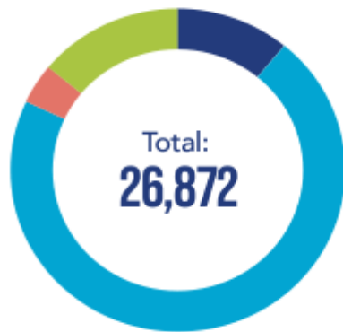
Total Trafficking Situations, by Form